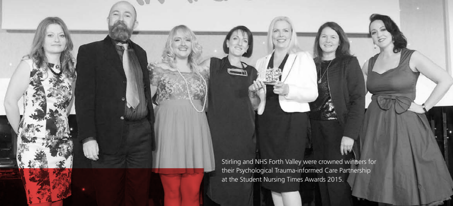
Stirling and NHS Forth Valley were crowned winners for their Psychological Trauma-informed Care Partnership at the Student Nursing Times Awards 2015.