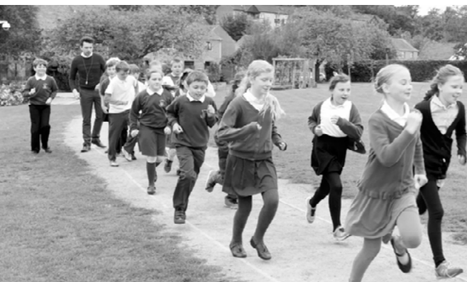
St Ninians school children run The Daily Mile.

As a publically engaged University, Stirling works hard to create a two-way exchange of ideas between communities and researchers. Stirling's public engagement encompasses a range of activities aimed at making a positive contribution to society.