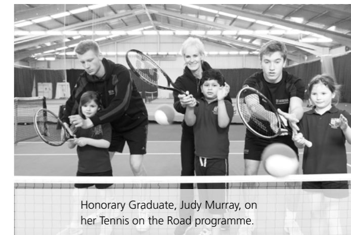
Honorary Graduate, Judy Murray, on her Tennis on the Road programme.

Cabinet Secretary for Culture, Europe and External Affairs, Fiona Hyslop, also spoke on campus prior to a Gallipoli lecture delivered by distinguished military historian Professor Sir Hew Strachan.