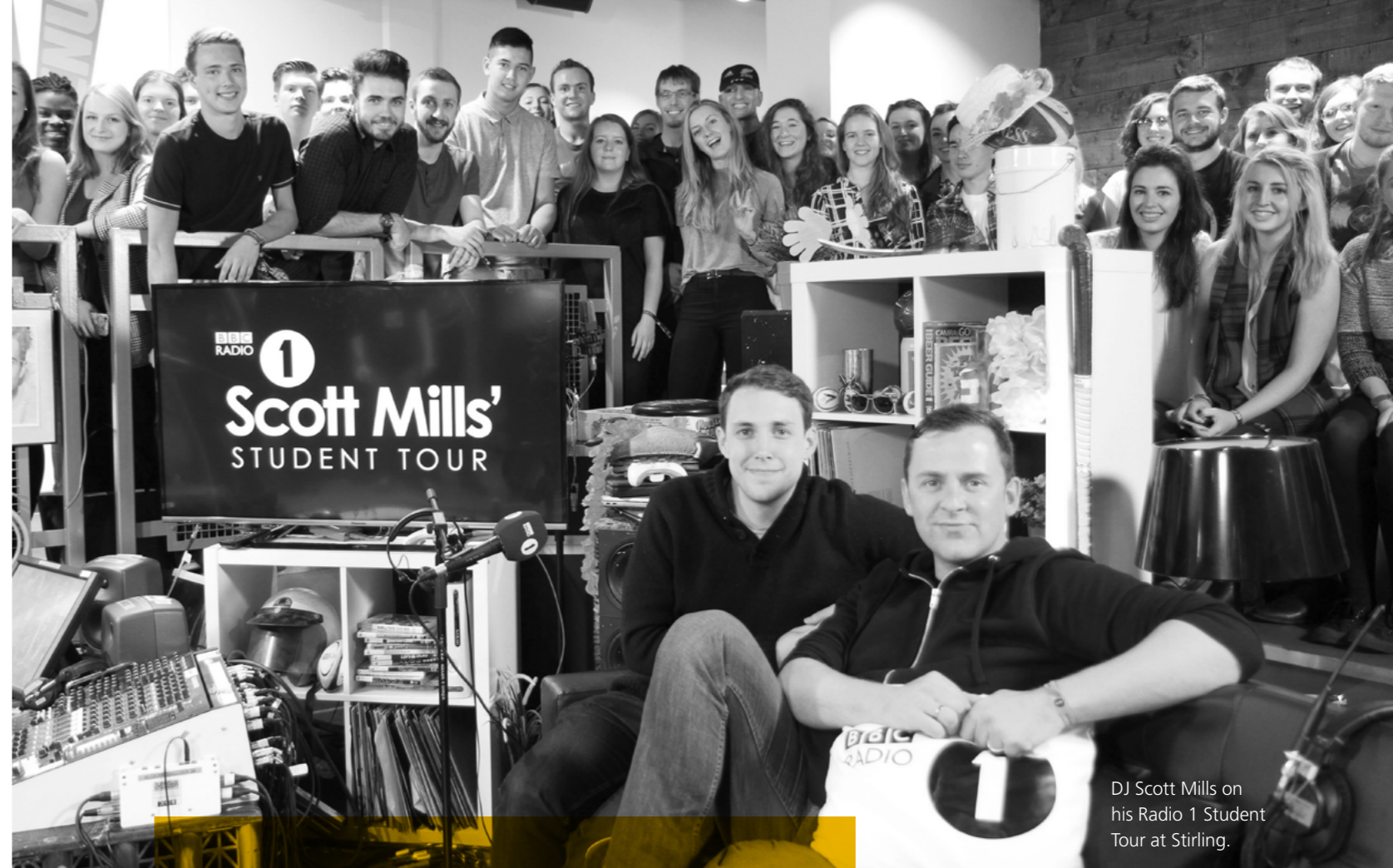
DJ Scott Mills on his Radio 1 Student Tour at Stirling.